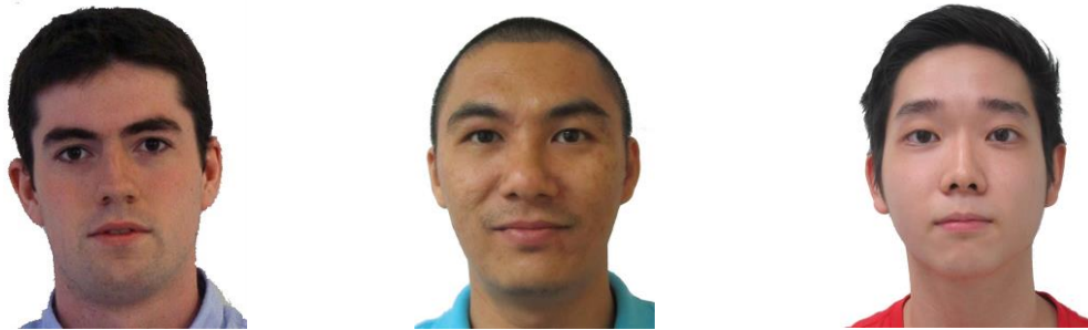
Figure 1. Sample stimuli used in the study. From left to right: Caucasian male, Malay male and Chinese male.

child faces (adult face bias). All photographs of faces were full-color images taken at a frontal position on a white background.