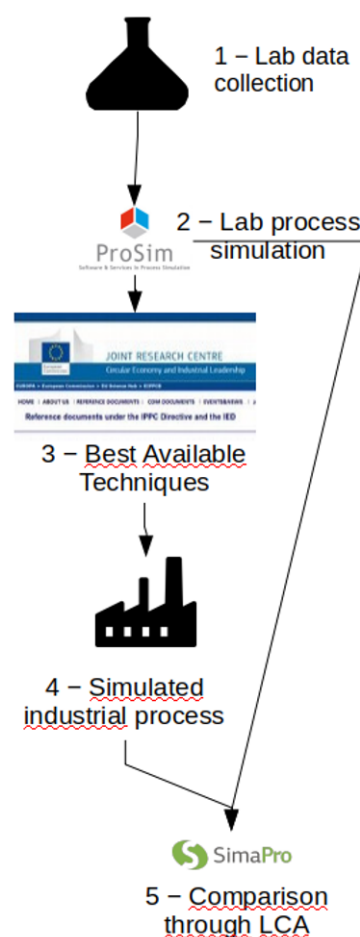
Fig. 1. Steps of the proposed framework.

After this, whether an idea of the size of the industrial installation is known or not, Best Available Techniques, as defined in the European directive on Industrial Emissions [4] can be associated with each step of the chemical reaction. Reference documents published by the European Commission provide a precious help to select techniques that could be applied for the simulated factory, according to its industrial sector. This step